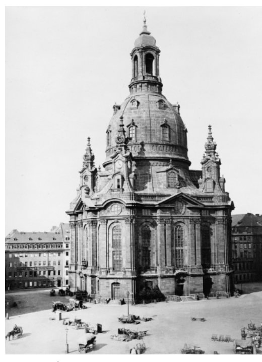
Frauenkirche, Dresden, 1880

A little research revealed that the Frauenkirche was built between 1726 and 1743 as a Lutheran parish church despite, or maybe