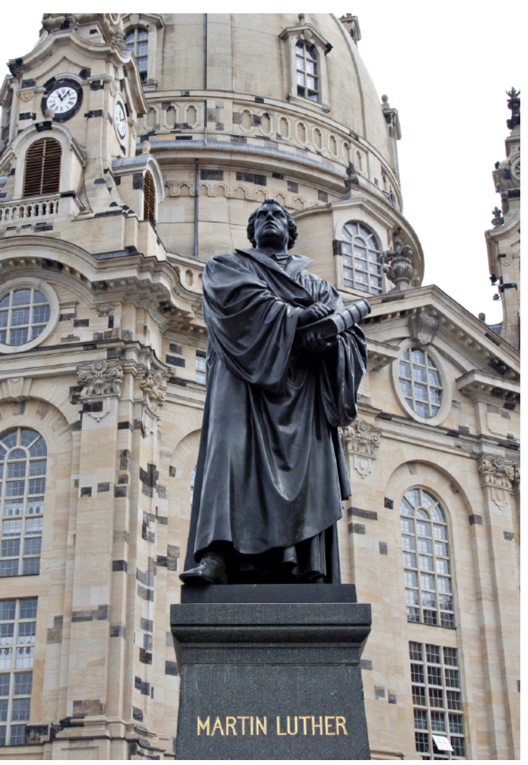
Frauenkirche, Dresden, today

declared a memorial against the war, and commemorations were held at the site on the annual anniversary of the firebombing destruction of the city. In 1985, the city decided to rebuild the Frauenkirche, but little was done until after the reunifica-