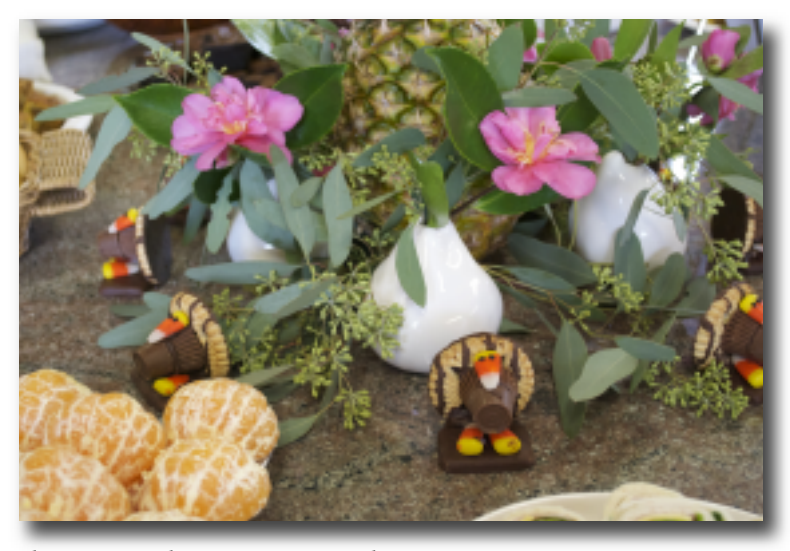
The women in the congregation did their utmost to provide festive and delicious refreshments for the celebration.