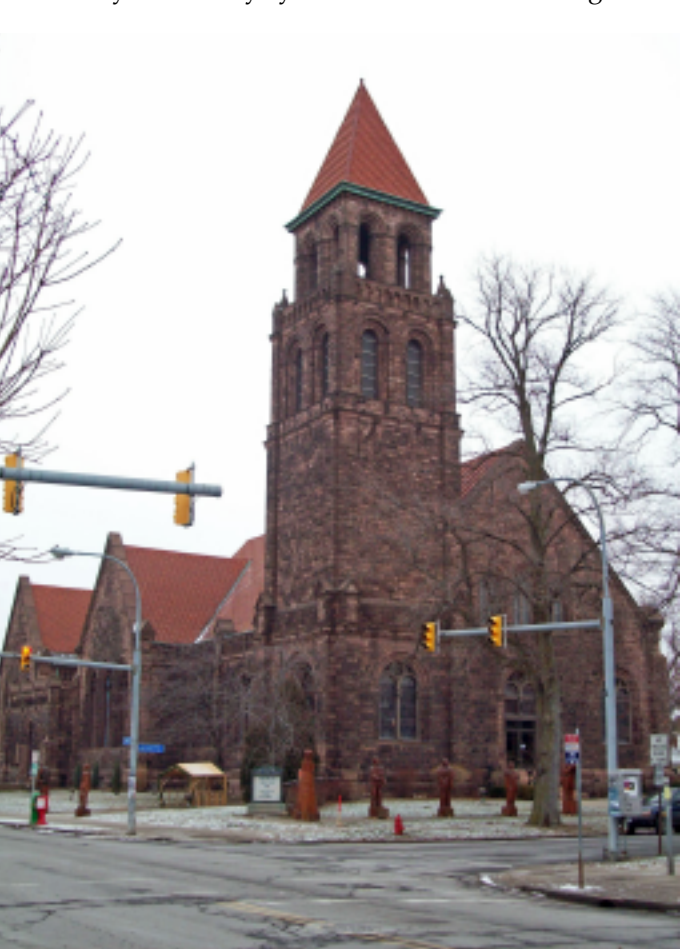
in khaki pants and a blue collared Lafayette Avenue Presbyterian Church, New York, NY