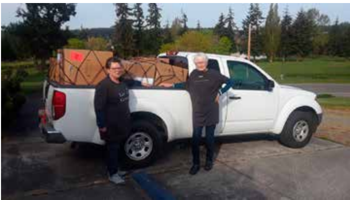
All 12 boxes were loaded into the truck and off we went to Bothell.

Six quilters packed 98 quilts into boxes that weighed 25 to 28 pounds. Each box contained 7-9 quilts that were rolled and tied. This is a very hard job as we need to get the quilts as small as possible so that they fit into the boxes. The boxes are then given two bar code slips, one goes inside the box and the other is taped on top of the box. Then they are weighed. On April 29, they were loaded into Carol Kong's truck and taken to a pickup place in Seattle. From there they will be loaded into a huge truck and stored until needed. The quilters will get a report as to which country our quilts were sent.