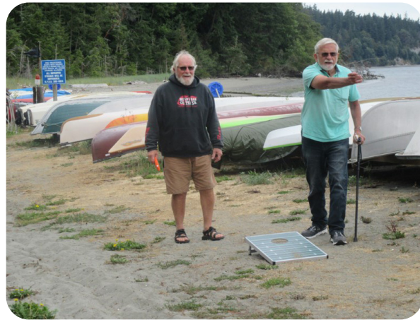
The Men of Grace held their annual BBQ on Friday, August 20th, at the Kala Point Beach. A good time was had by all!